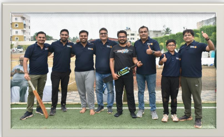
RCS Gladiators : Runner Up