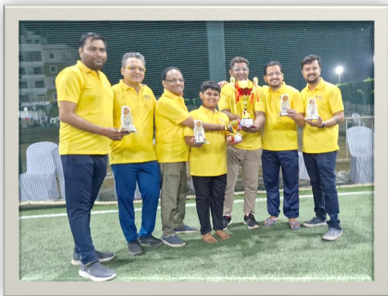
RCS Foodies : Winners